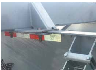
Galvanized frames and bunks, sliding bunks