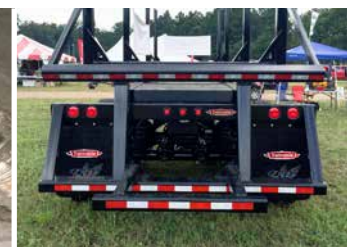
Lift Bumper Bar

Also available : Drop deck, air ride, two speed support capacity of 160,000 lbs. and triaxle suspension