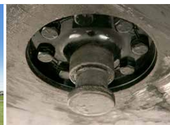
Bolt-on King pin