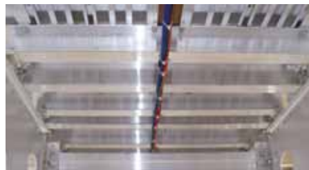
60,000 lb capacity coil package