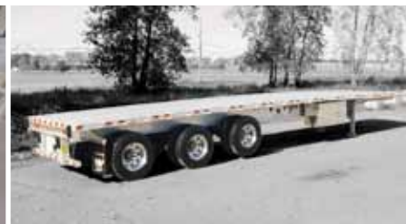
Variety of axles configuration available