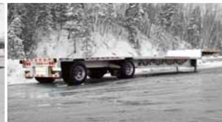
Drop deck models